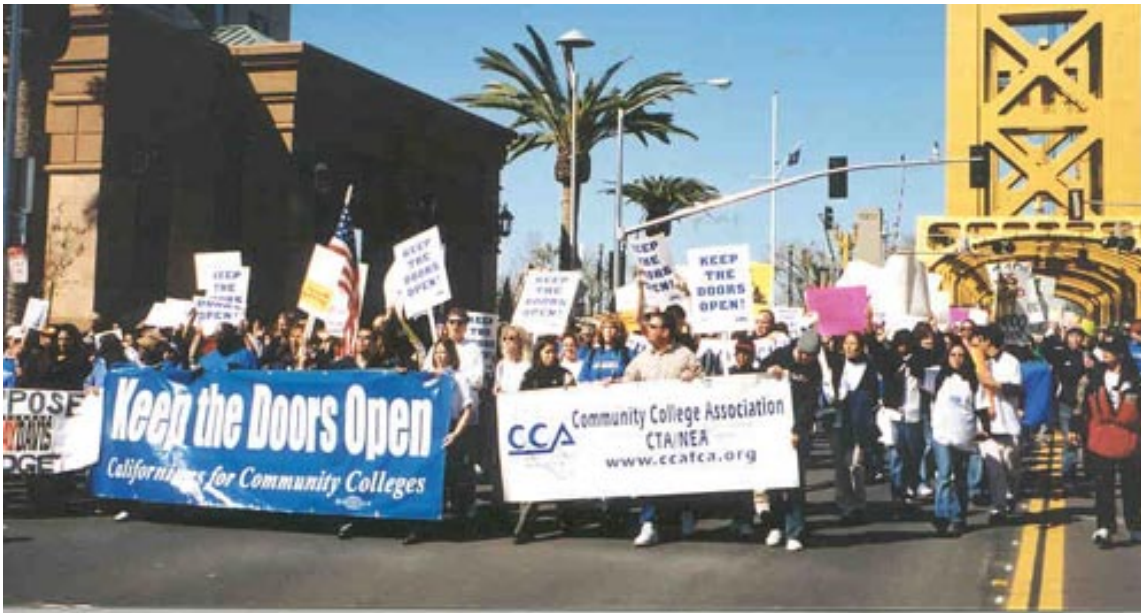
Cruz Bustamante (Lieutenant Governor) joined the march when we made it over the Tower Bridge.