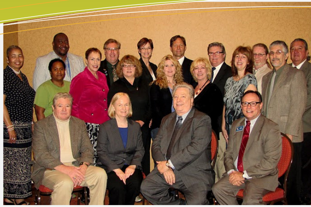
CCA Executive Board 2010-2011

A full 62% of those polled said they found "totally unacceptable" the concept of eliminating collective bargaining rights for public employees. The poll was commissioned by the Wall Street Journal