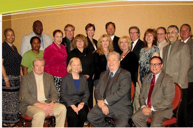
CCA Executive Board 2010-2011

A new poll by the nonpartisan Public Policy Institute of California finds that a 59% of Californians like their local schools, 59% say schools in poorer economic areas are not as good as schools in the more affluent neighborhoods, and 53% believe local governments are not providing enough support for local public schools.