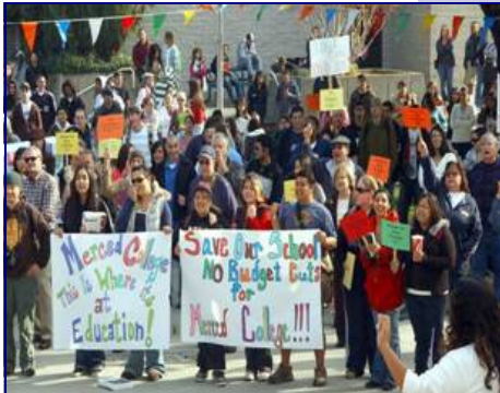
Above: Students at Merced Community College protesting the cuts in the budget. On March 16 CC students and faculty will march on Sac.